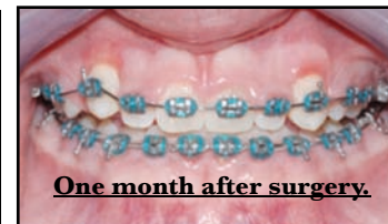
One month after surgery.